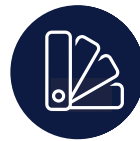
Available In 4 Colours