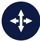
Horizontal Or Vertical Direction