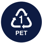
Recycled PET Felt Base

Available in 2.4-metre lengths, each Panel simply sits flush with the next Panel and is secured through the recycled felt base. Each Panel can be cut with a handsaw or circular saw, or a utility knife through the felt.