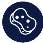
Easy To Clean