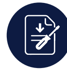
Quick To Install