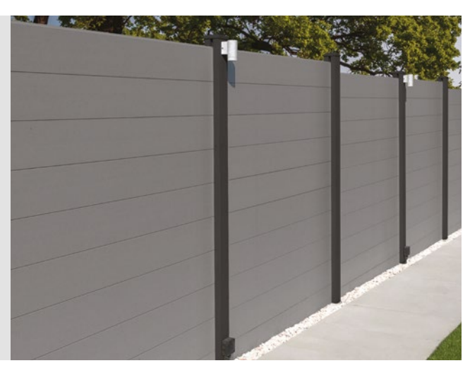
Pictured - Stone Grey Fencing Panels, Charcoal Posts and Post Caps

Cladco Composite Fencing products are available in a range of attractive colours. Have you considered using different colours for the Posts and Panels to complement or contrast your garden design?