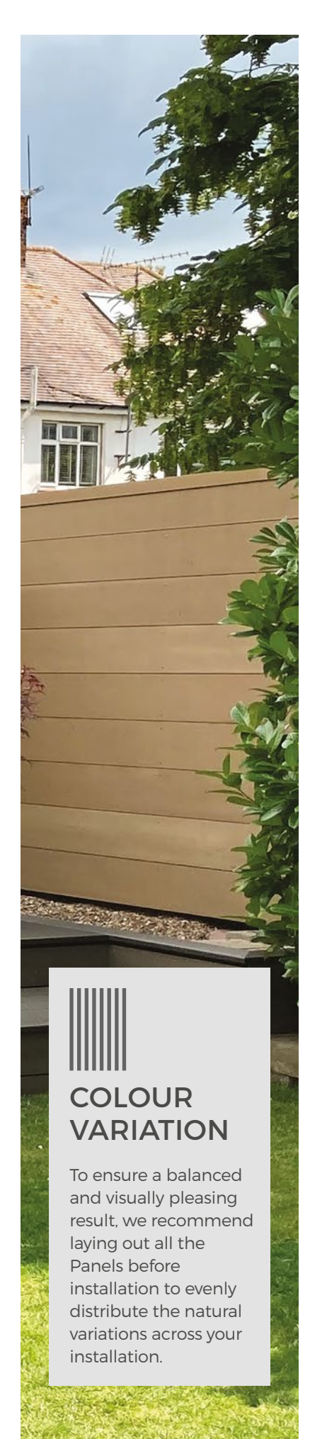
Pictured - Teak Composite Fencing