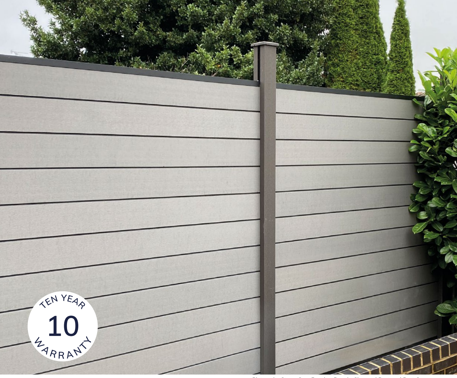
Pictured - Stone Grey Fencing Panels, Charcoal Post and Post Cap