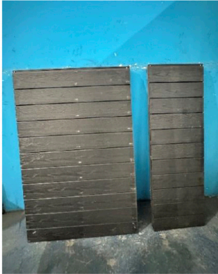
Front view (test side)