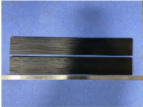
The whole product