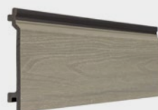
PROCLAD COMPOSITE WALL CLADDING BOARDS