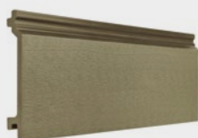
SIGNATURE COMPOSITE CLADDING BOARDS