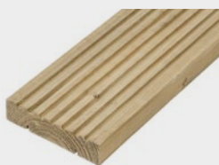
TIMBER DECKING BOARDS