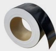
FRAME PROTECTION DECK TAPE